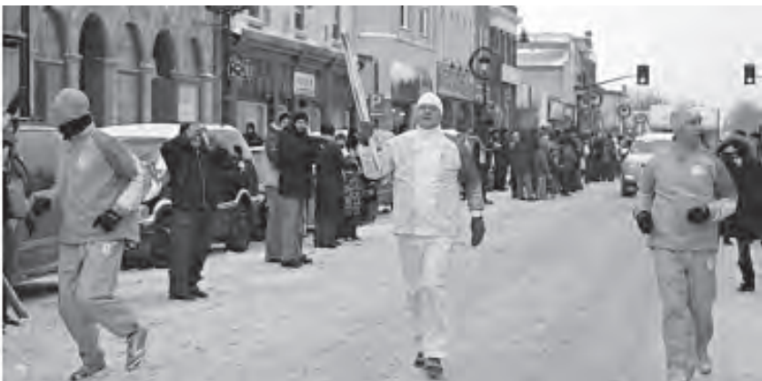
A different kind of Kincardine Parade