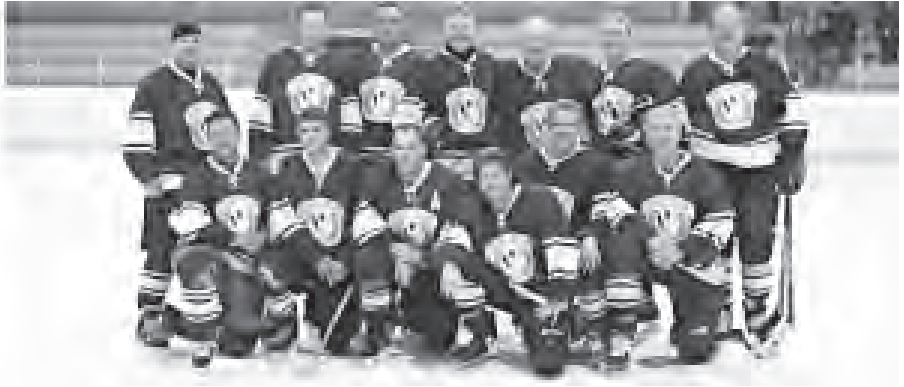
2009 Thanksgiving Hockey