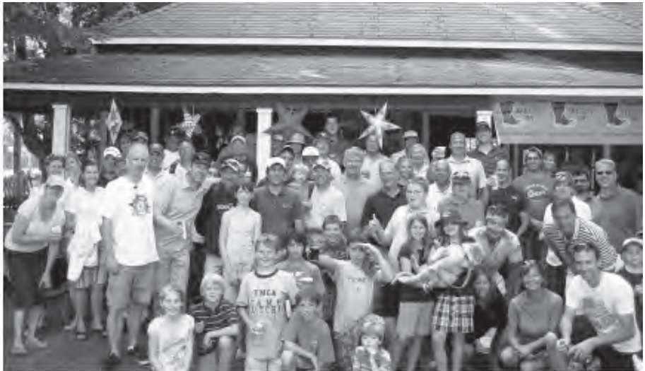
Standing Room Only — Once Again — at the 2009 Billy Open

Your 2010 BBQ ticket order form is among the inserts.