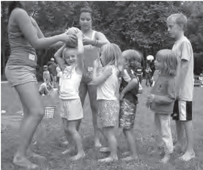
Learning teamwork starts early on Games Day

(Please avoid driving past the Church Grove during worship)