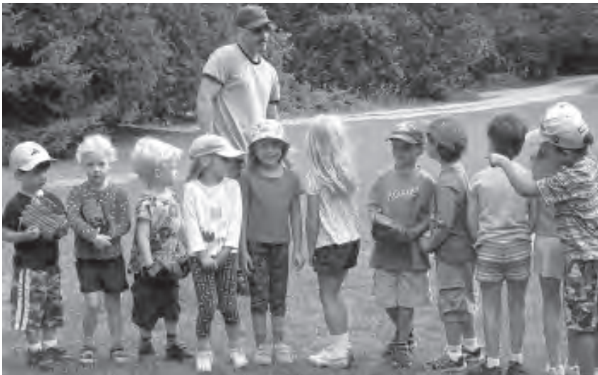
Junior Baseball — I want that girl on my team